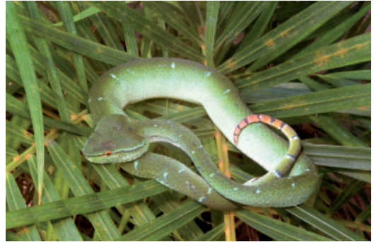
Figure 2. Tropidolaemus wagleri , common “green form” from Lambunu, North-Sulawesi.

Acknowledgements. We are grateful to Mark Wootten, UK for the quick correction of the English language.