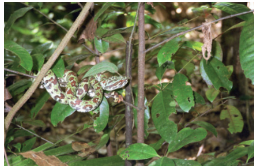
Figure 3. Tropidolaemus wagleri , “red form” from Tangko-Batuangas Nature Reserve, Northeast-Sulawesi.